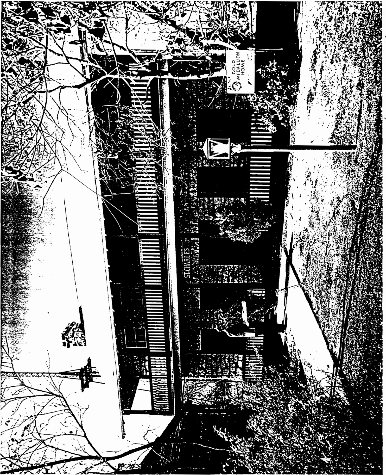
JAME RUTLAND STANDS IN FRONT OF Wm M. OWEN HOUSE, O. 1966. STORE - POST OFFICE STRUCTURE AT LEFT (NORTH OF HOUSE)