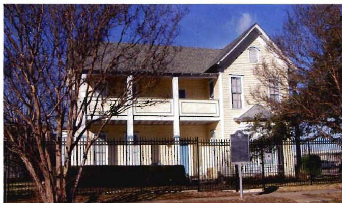
A historical plaque marks the front of 1004 S. Church Street.